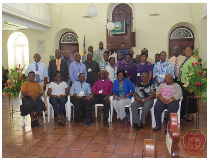
US Virgin Islands Delegates