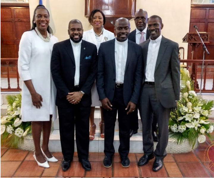
Members of the new PEC