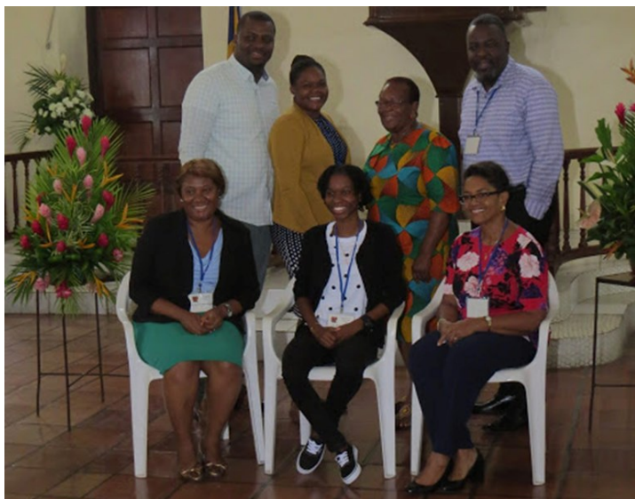
St. Kitts Delegates