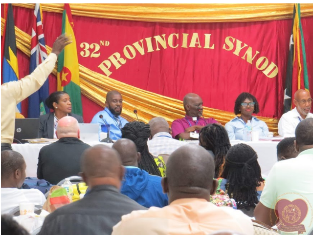
Synod in session